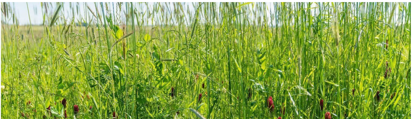
Image: Cover crops can reduce pest pressure, retain soil moisture, reduce soil temperatures, and mitigate nutrient loss.