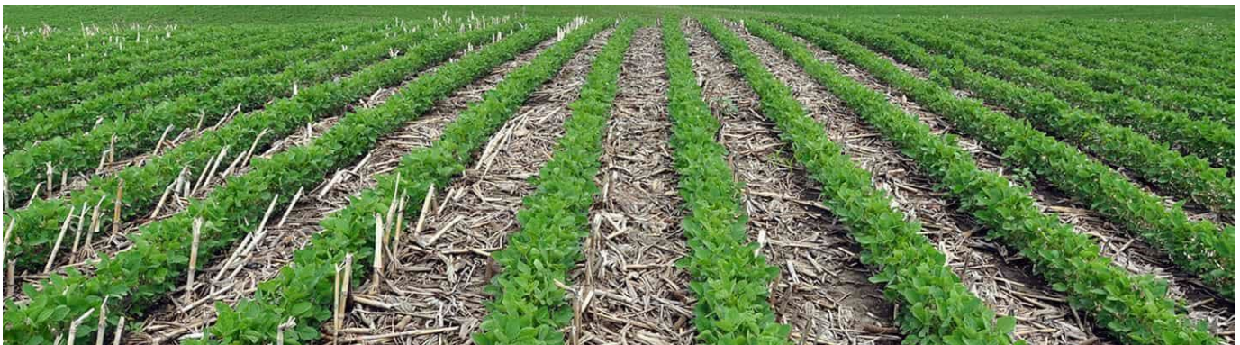
Image: Soybeans planted into no-tilled corn residue.

Models of future climate indicate that temperatures are projected to warm, precipitation is expected to become more variable and extreme, and the growing season is anticipated to continue to lengthen. The climate projections in this section are based on the average of 17 different climate models. 7 Two possible futures are presented: a moderate emissions scenario in which greenhouse gas emissions peak around mid-century and then slowly decline, and a higher emissions scenario in which emissions continue to rise throughout the 21st century. 8 Careful planning and adaptive action can lower the risks of climate change impacts for producers. There are many ways to adapt to climate change based on the situation and needs of a particular farm, and some examples are presented below.