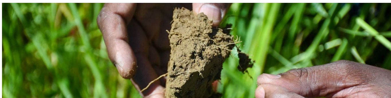
Image: Checking soil aggregate for organic matter and stability.