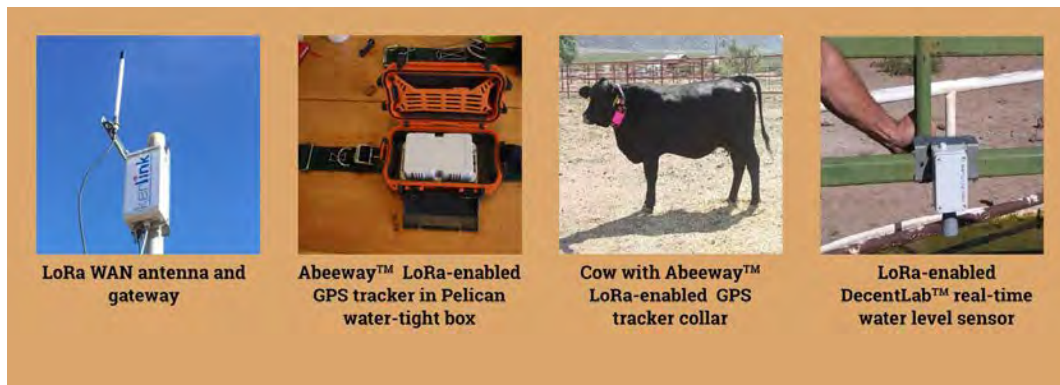
LoRa WAN antenna, Abeeway™ tracker collar, DecentLab™ water level sensor and LoRa WAN real-time tracking of cattle via GPS, a component of the USDA, NIFA CAP precision ranching system.