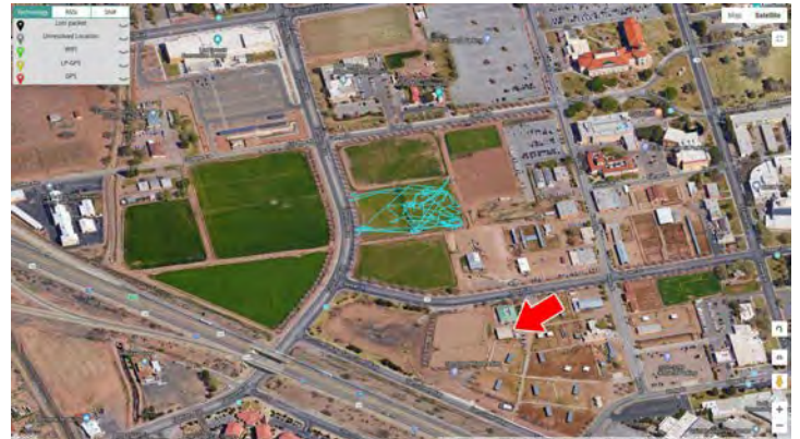
Real-time GPS locations of one cow (blue polygons above) grazing a small pasture at the NMSU Campus Farm during preliminary tests in April 2019. Data are available via the ThingPark™ dashboard online. The system recorded over 99% of GPS fixes (5 min intervals). The antenna and gateway (red arrow) were located <100 m from the pasture.

A PR system typically consists of sensors that log and transmit data to a network, network antennas and gateways, cloud data storage and analysis, and a graphical interphase or dashboard that summarizes sensor data trends and that can be used to configure the sensors. The SW beef CAP plans to develop a PR system based on LoRa WAN, a low power wireless platform that is being used increasingly to connect devices in the Internet of Things (IoT). The technology is well suited for rangelands since it can transmit small packets of data over distances of up to 10 km. It is currently being used in extensive pastoral systems of the Scottish Highlands by scientists at Scotland's Rural College ( https://www.sruc.ac.uk/kirkton ) who are collaborating on the SW Beef CAP. The PR system being developed will provide close-to-real-time information on weather, water levels, and animal position. An example of the components of the PR system being developed by the SW Beef CAP team is provided above.